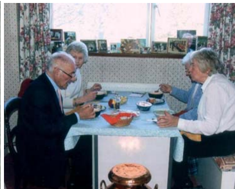
A full table in the sitting room